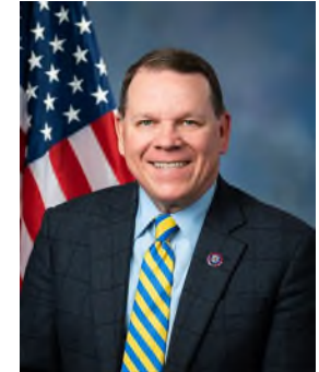
Caucus Chairman Sam Graves (R-MO)